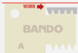
Fig 2: Worn Belts (Red Line is Reference Level)

This edge for Bando Rib Ace® Aramid belts